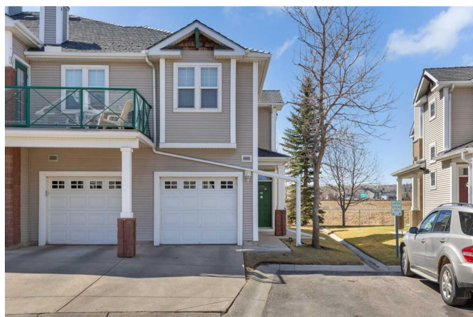
39 Hidden Creek Pl NW #304

Welcome to this beautiful end-unit in Hidden Valley's Hansen Creek Manor! West Backing onto a beautiful nature reserve with a freshwater pond and nestle in very conveniently located in a sought-after community of Hidden Valley NW. This single front attached garage townhouse is idle and perfect for those attempting to downsize into a quiet living space, surrounded by a welcoming neighbourhood with exceptional scenery and many walking paths. Also good for First-Time Home Buyers or investors to live or grow their equity. This home offer you ground floor single attached garage parking and 2nd floor quite living with the beautiful views from spacious and bright living room with cozy fireplace and dining. A very Bright and open concept floor plan loaded with two bedrooms and two bathrooms, open kitchen and dining, multiple pantries and closets. A big master bedroom with 4 pcs ensuite allow you to have your sound sleeps quietly. When the living room off the patio door the huge and sunny deck welcome you for the more sounding nature views and warmth for your summer BBQ to you and your guests. This home is very conveniently and closely located to the Schools, Gas Station, Small plaza with restaurant and other. Also only 2-5 minutes drive to Creekside Shopping Centre. A very easy and quick access to the STONY TRIAL allow you to drive to BANFF, EDMONTON and