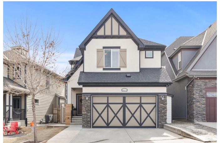
Main Floor Exterior Area 925.92 sq ft Interior Area 851.52 sq ft Excluded Area 473.04 sq ft

Welcome to your new spacious home, conveniently located on a quiet street in south Mahogany; one of Calgary's sought after lake communities. On the main floor you will find a bright and open floor plan, a living room that is welcoming and elegant with a beautiful gas fireplace and Hunter Douglas window coverings throughout. The kitchen is bright and spacious with stainless steel appliances, quartz countertops, silgranit sink, plenty of storage drawers and an upgraded pantry with rollout shelving. It has a unique but conveniently located "tech room" that can serve as a pocket office or even a butlers pantry. The main floor also includes a 2-piece bath and a walkthrough mudroom with built in storage lockers that lead to an oversized (extended) 2-car heated garage. Upstairs features a large open bonus room, two additional good-sized bedrooms (both extended in size with the extended garage), a 4-piece bathroom, a laundry room with built in cabinets, and a linen closet for additional storage. The primary bedroom has a spacious walk-in closet and a 5-piece ensuite. Downstairs, the basement, has just under 9' ceilings, is partially finished with completed framing, roughed-in electrical and plumbing so it's ready for your final touches. There is also a large storage room with plenty of built in shelving. You will also find Glow Stone track lighting, a fully fenced south facing backyard with composite deck,