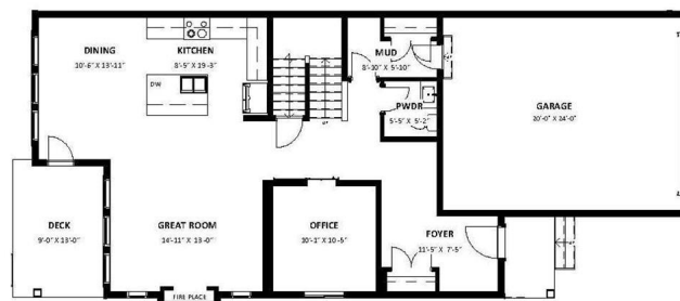
MAIN 1,085 SQ.FT. GARAGE 477 SQ. FT.