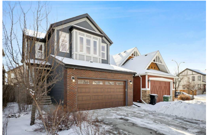
66 COPPERPOND HEATH SE

Family Approved - five bedrooms + two dens ** Extensive upgrades and superior quality, with 3500 square feet of air-conditioned luxurious living space. You will be impressed with the privacy of an oversized traditional homesite with a private south-facing backyard with a bespoke 13' x 12' covered deck. This seasonal, airy design provides relief from the sunniest to the snowiest days while providing an uninterrupted view of the surrounding gardens. Enjoy this convenient Copperfield Location - Steps away from the ponds, Ice rink, parks, pathways, schools, shopping, soccer, skate park, health care, transit, South Pointe Hospital, and the major south expressways. Living a community lifestyle makes Copperfield an outstanding, safe, and secure community. Rich curb appeal with architectural features - dramatic roof lines, 24' x 21' attached garage with wood-style detailed door & full-sized concrete driveway, covered entry, and brick-faced front complete this spectacular elevation. There are extensive upgrades throughout, and the details are superb. This is a must-see home! Chef's™ kitchen includes granite countertops, custom light wood shaker style cabinets/doors, extension trims, high-end KitchenAid stainless steel fridge/dishwasher/microwave/wall oven, gas cooktop range with 5 burners, recessed lighting, oversized central island, peninsula island with a flush eating bar & black granite under mount sink, extra cabinet storage & a